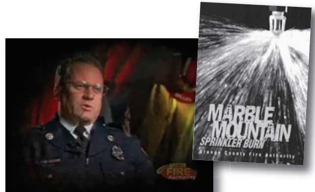
Marble Mountain Sprinkler Burn (Orange County Fire Authority) http://youtu.be/UmZIN-j_Glg

https://service.govdelivery.com/service/multi_subscribe.html?code=USDHSFA