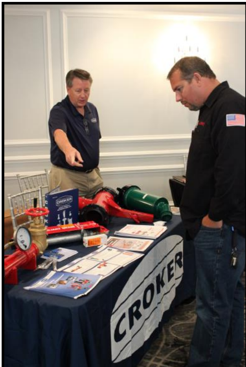
Croker, new testing equipment company.