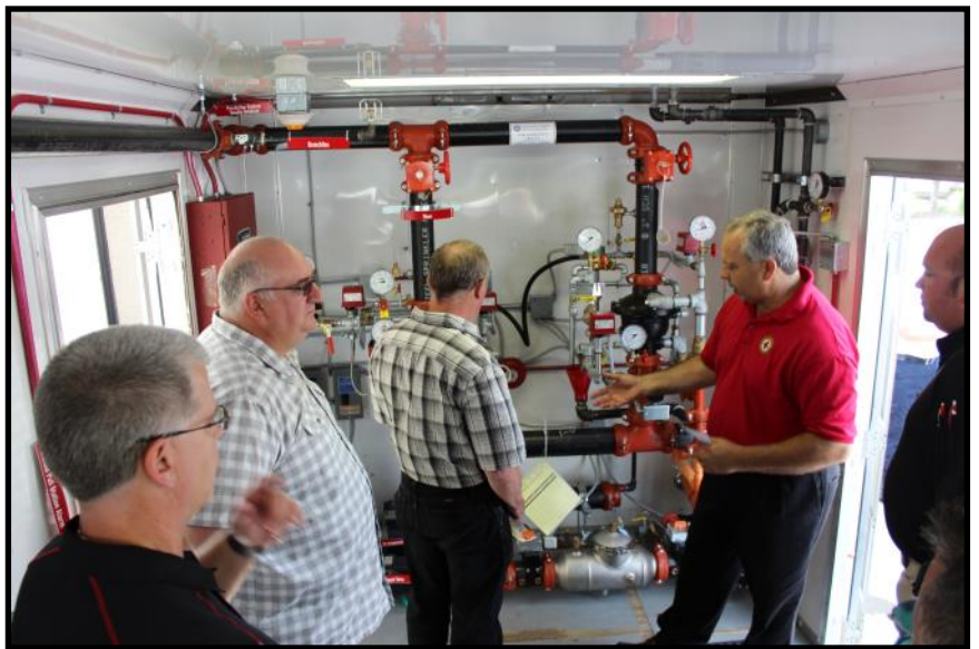
Above, trailer tours and demo.