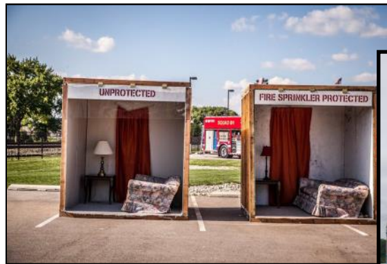
Our 11th side by side of the year was conducted.