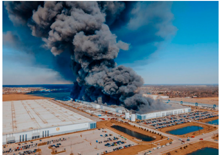
Scene from the March 15, 2022 fire at the 1.2-million square-foot Walmart Distribution Warehouse in Plainfield, Indiana

Today's fire service faces growing challenges when responding to fires in massive warehouse facilities—some now exceeding 4 million square feet. Participants will hear firsthand lessons learned from the chief officers who responded to this complex mayday incident.