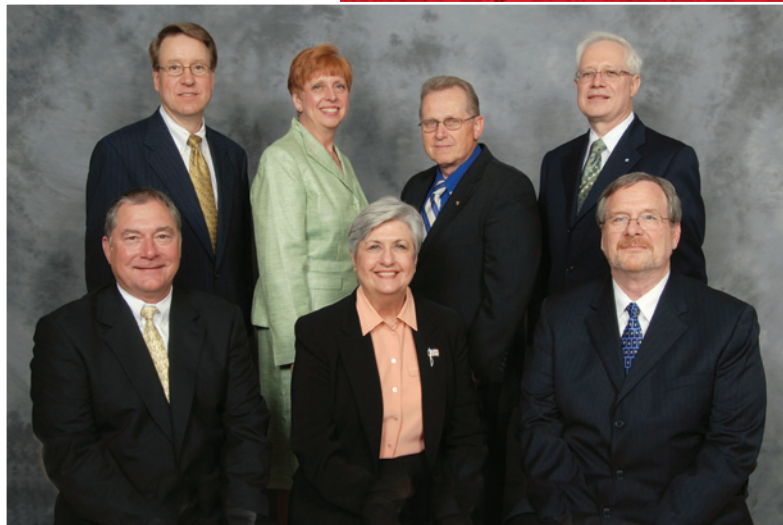
Village of Mount Prospect Board of Trustees

Congratulations for following FEMA's America Burning guidelines for the protection of citizens and FEMA's Firefighter Life Safety Summit recommendations for the protection of firefighters.